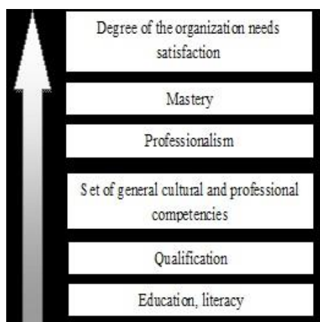
Figure 1. Levels of employee’s competence qualification formation.

The process of transformation and development of employee’s competence is reflected in the innovative receptivity of the organization. Based on this, it is advisable to consider competency as the main category of the competence approach, both in personnel management and in professional education.